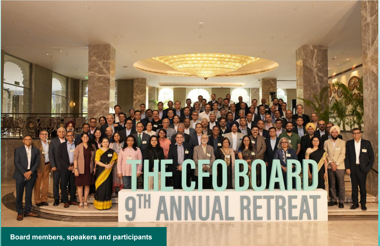
Board members, speakers and participants