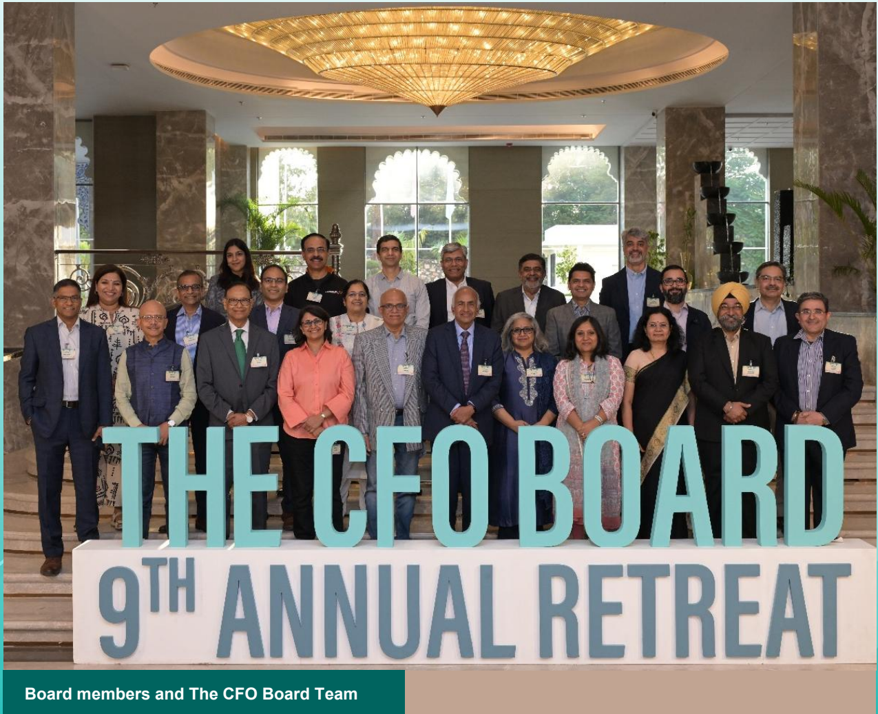
Board members and The CFO Board Team